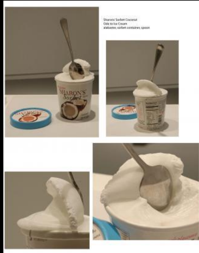
Sharon's Sorbet Coconut Dile to Ice Cream sharon's, sorbet container, spoon